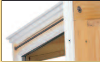
Threaded metal rods keep window plumb and square while minimizing sagging