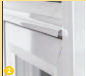
2 Casement drip moulding eliminates water from entering window