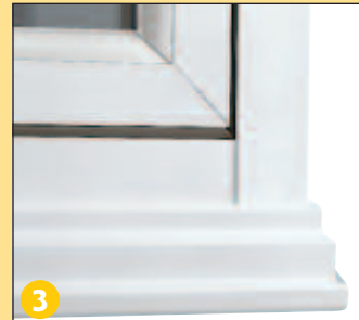
3 Bottom drip moulding adds beauty and attention to detail