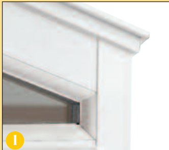
1 Roof drip moulding directs water away from roof and off of glass